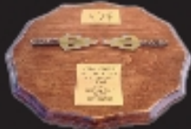
Gordon Winters Over All High Score Awards Designed and provided by Jim Allen. Awards shown are example not 2016 awards, 2016 awards will be revealed at shoot.

Directions to range: From Modesto take SR. 132 (Yosemite Blvd.) East approximately 13 miles to Waterford. Continue East on SR. 132 approximately 4 miles to Reservoir Rd. Turn left on Reservoir Rd. to park entrance. Follow signs to range.