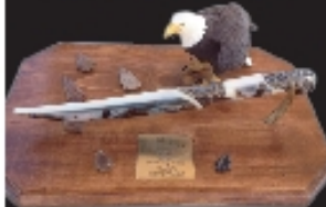
Bill Sullivan Over All Award