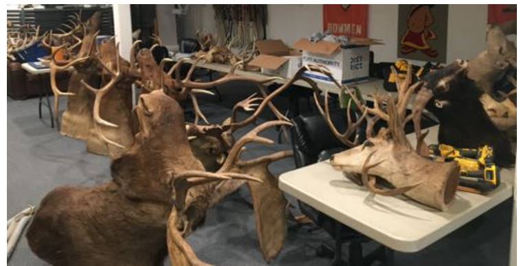
JUST PART OF OUR COLLECTION

Finally, your Big Game Committee has secured around thirty antlers, horns, tusks and beards for our mobile measurers training clinic. Since we were unable to have our State Broadhead Shoot funds are extremely low. We are gladly accepting donations ($100 and more) made out to California Bowmen Hunters Big Game Club . On the other hand if you have a 6 or 7 foot wide trailer 10 to 14 feet long and 7 foot tall and would like to donate it; we would be pleased to speak with you immediately. Send donations to Terry Mikesell, PO box 491990, Redding, CA 96049-1990, or call 559.877.2701