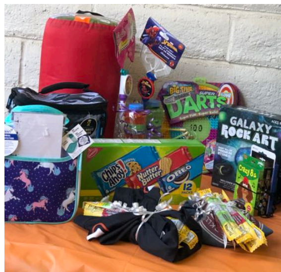
KIDS RAFFLE TABLE

Come mid morning though, 4 of the archers had to leave Another fire had started 20 miles south of us and those 4 were possibly affected, so they had to leave. But not without us giving the 2 kids the decorated pumpkins for the ride home (fire is out now, and their home was safe). Continued on page 10