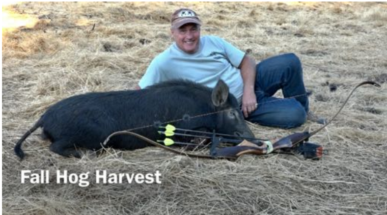
Fall Hog Harvest

Nothing clears a troubled mind better than shooting a bow! Fred Bear