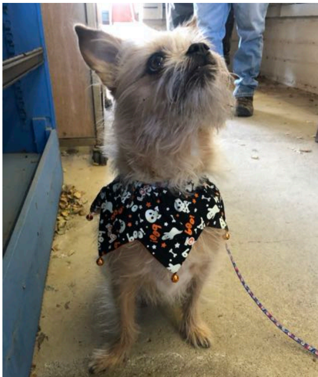
"SISSY" DRESSED UP PET-PARENT DIANA WANNAMAKER