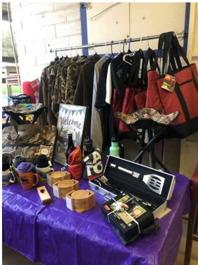
SOME OF THE RAFFLE PRIZES

Of course, the day before our fun shoots, the weather was perfect! No wind, no smoke and no heat. But no, can’t hold out for one more day. We had sustained winds at 25 mph and gusts at 40-50 mph.....However, with that being said, we still had 35 archers that wanted to play!