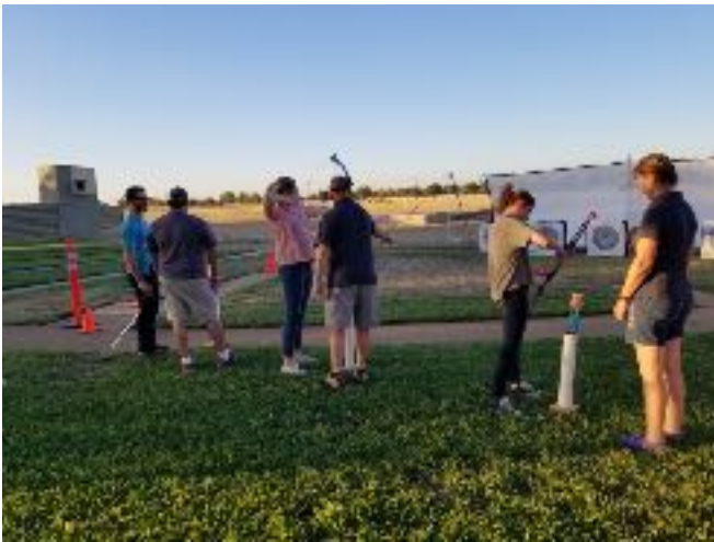
Caucus Shooting Line