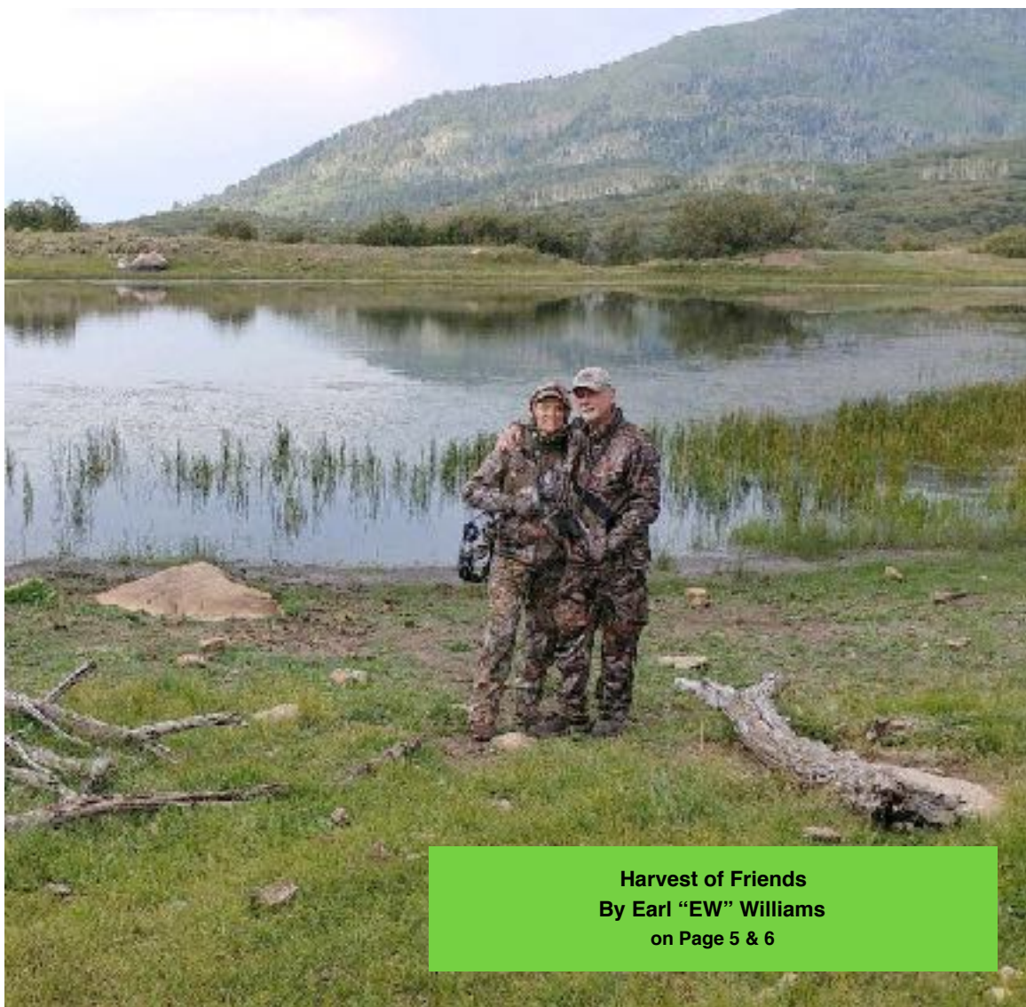
Harvest of Friends By Earl "EW" Williams on Page 5 & 6