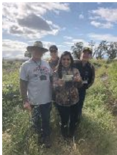
The Buck Was Found!