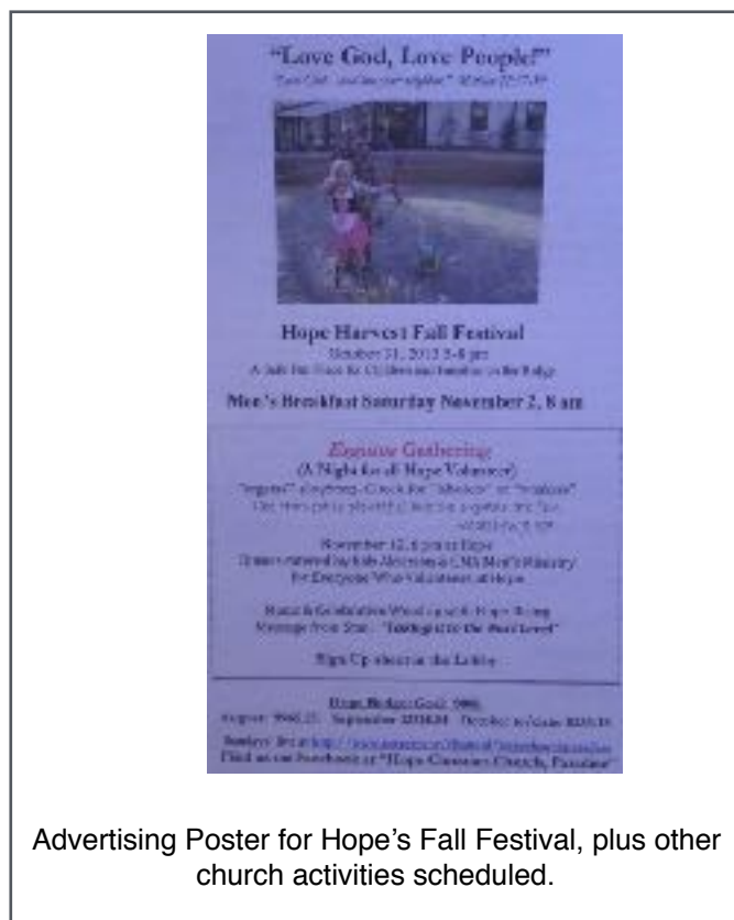
Advertising Poster for Hope's Fall Festival, plus other church activities scheduled.

For the last 3 years our Men's Group has sponsored a retreat for men who reside at the Chico Rescue Mission, which is 20 miles away in Chico. Most of these men have had life difficulties with liquor, drugs, arrests, or just every day problems coping with life in general. The Chico Mission offers a 12 month God based Bible Teaching with work programs to develop skills. Each of the men residing at the Mission must agree to and sign a commitment of 12 months clean living for the Board and Staff of the Mission. With God's and the Missions assistance many men over the years have been able to start a new life of being a credit to themselves, their families and our Community.