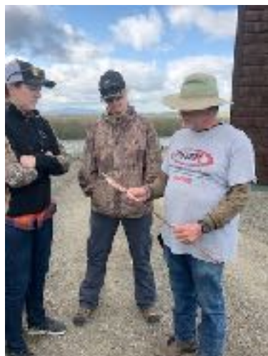
Examination - Blood on the Arrow