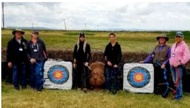
Saturday Morning Target Archery Session

Friday evening after dinner everyone went out to Grizzly Island Wildlife Area and spotted Tule Elk. Saturday morning had another target archery session. Saturday afternoon was an IBEP field qualifier session for bowhunter education certification. The ladies finished up the session following a blood trail to find the buck. All passed the state test and received the IBEP certificate. It was an honor to continue the CBHSAA tradition of participating in the BOW program.