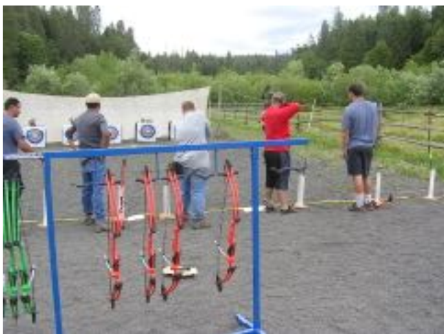
One group of the men shooting archery at our Chico Rescue Mission camping retreat, June 9 th at Meadow Brook Ranch. Hosted by Hope Christian Church's Men.