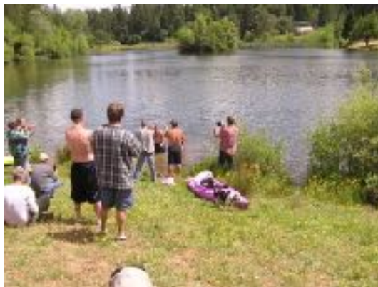
One of the 5 gentlemen who were baptized, committing their new life to Jesus. Washing there old life away, and promising to love the Father, Son and Holly Ghost.

Than time to repack all the camping gear, dirty cloths, and barn cleaning and reload everything brought in vehicles and return to the Mission in Chico.