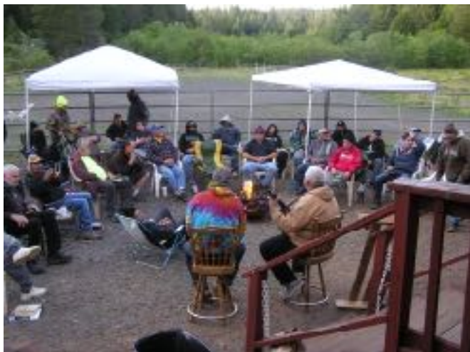
Saturday evening program, following our wonderful dinner of barbecued food.