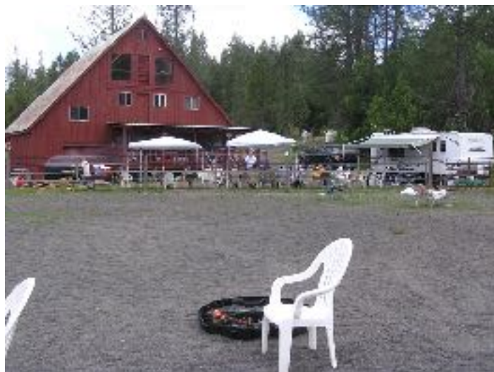
Photo of Red Barn our Men use during our retreats, to learn more about Jesus and each other

Lastly, I want to mention but definitely not least, most of the men gathered around several who have problems with life, offering hands on prayer talking to God, asking that he touch each of those we were praying for, to eliminate what every problem they have in their life. This was done for several men and we prayed to God & Jesus several minutes each time, knowing that when one or more are united in prayer and believe, mountains can be moved, and miracles take place.