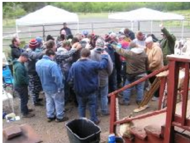
Ending our evening, we gathered around several men, with problems, asking God & Jesus to enter their lives and assist them in giving up old sinful habits. Starting over with new lives with Jesus.