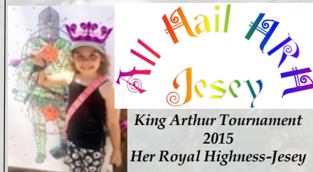
King Arthur Tournament 2015 Her Royal Highness-Jesey