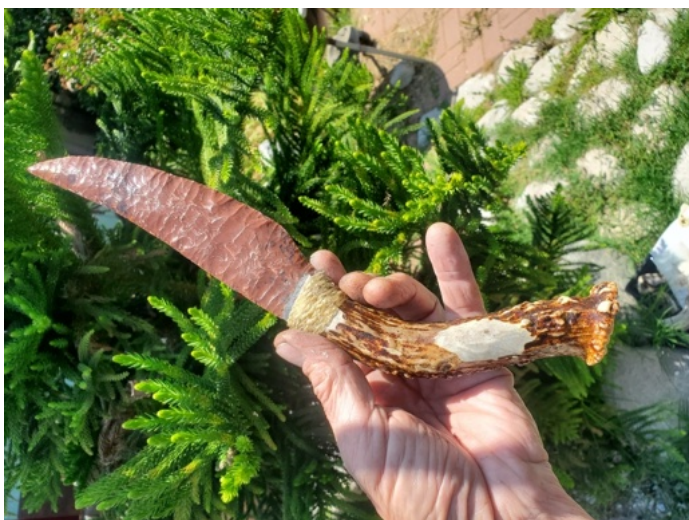
How Stone Age Humans Made Hand Axes