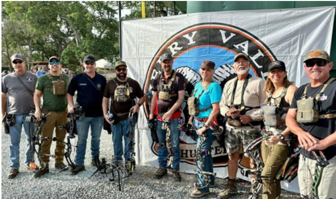
CHERRY VALLEY WITH A STRONG SHOWING