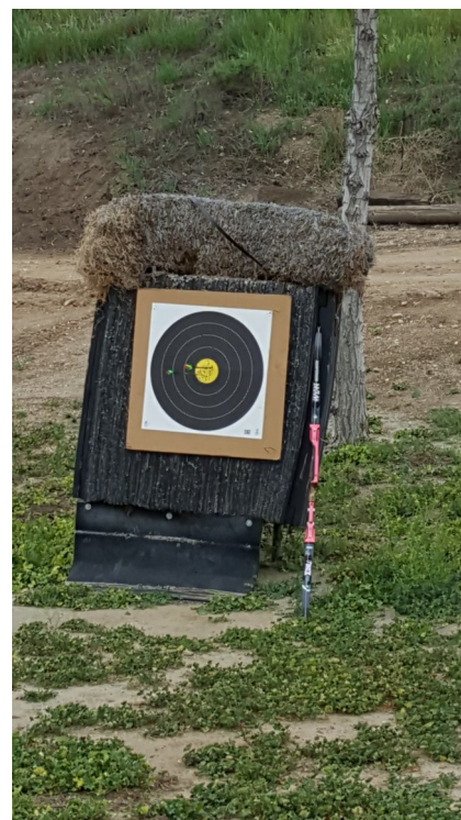
A 60 cm target face used for the World Archery (formerly FITA) field round.