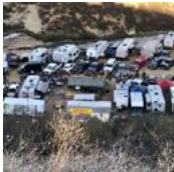
2021 BroadHead Championship Tournament